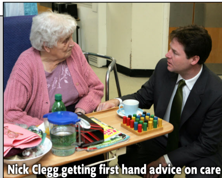
Nick Clegg getting first hand advice on care