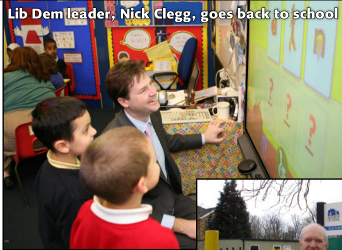
Lib Dem leader, Nick Clegg, goes back to school