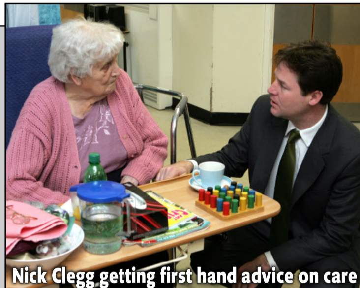
Nick Clegg getting first hand advice on care