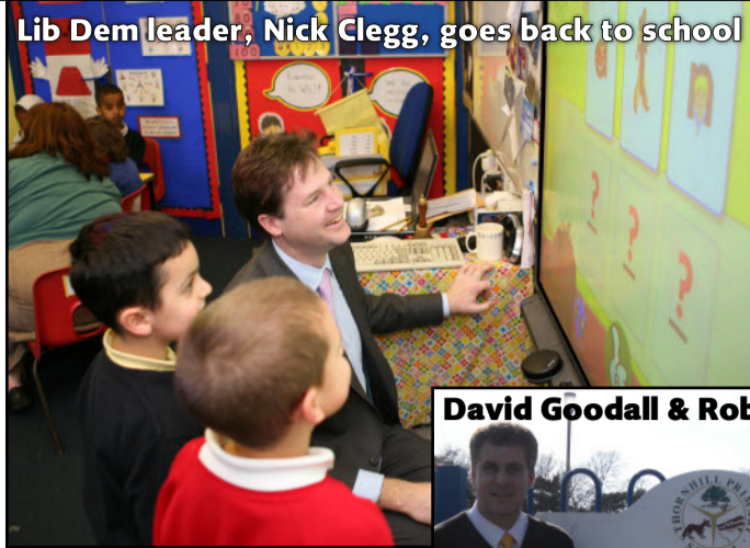
Lib Dem leader, Nick Clegg, goes back to school