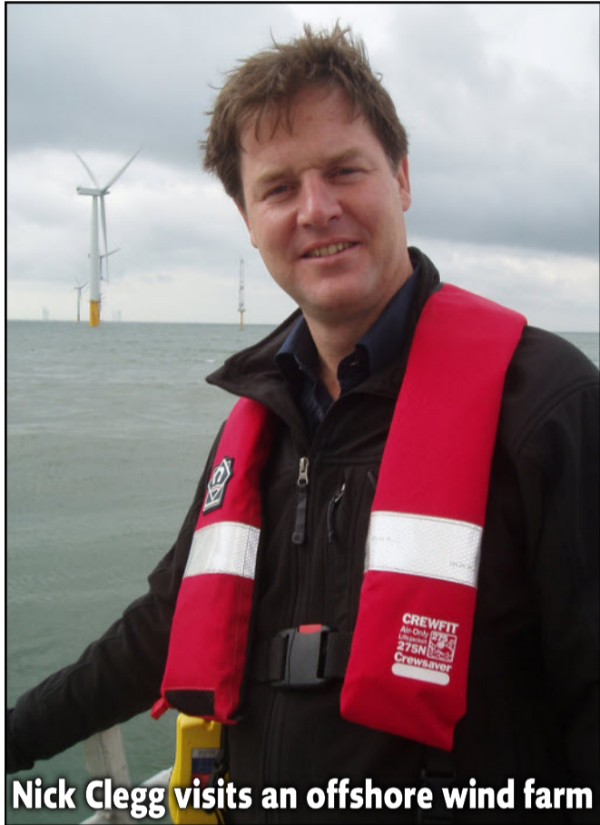
Nick Clegg visits an offshore wind farm

"The extra targeted funding would be just the boost our schools need"