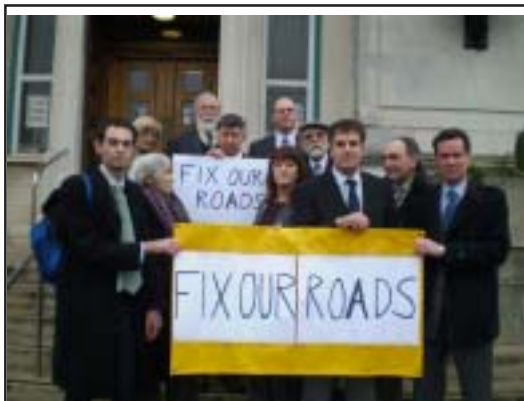
Local Liberal Democrats campaigning for more investment in our roads and pavements.

New improved quality standards - to ensure resurfacing and repair work that lasts.