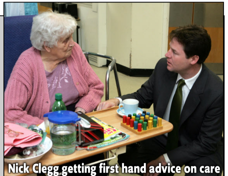
Nick Clegg getting first hand advice on care