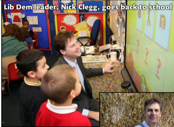
Lib Dem leader, Nick Clegg, goes back to school