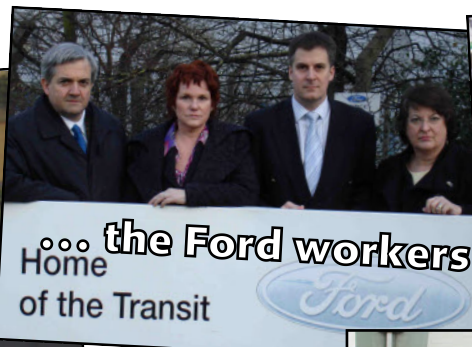
... the Ford workers Home of the Transit