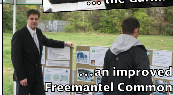
... an improved Freemantel Common