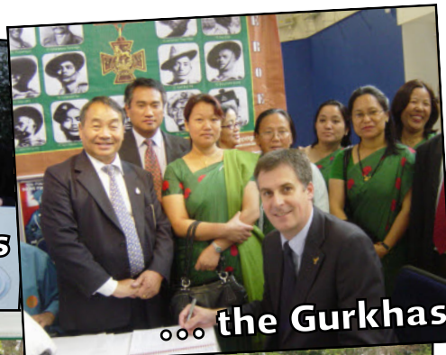
... the Gurkhas