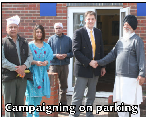
Campaigning on parking