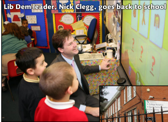
Lib Dem leader, Nick Clegg, goes back to school