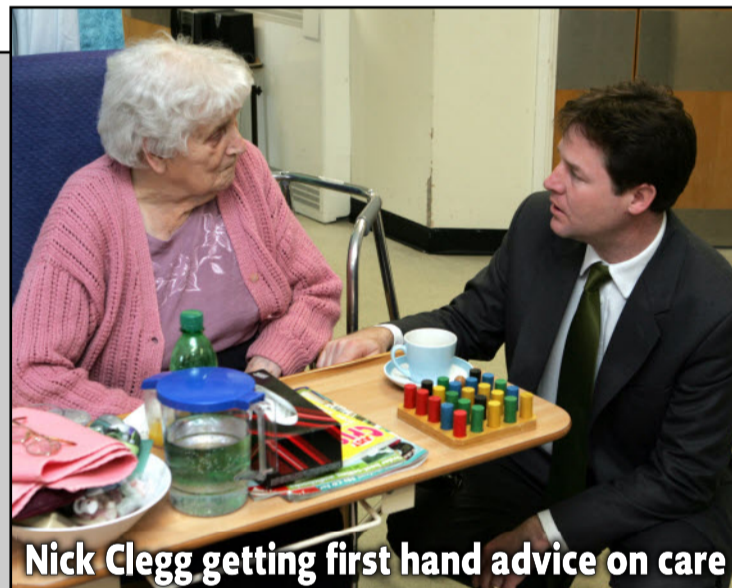
Nick Clegg getting first hand advice on care