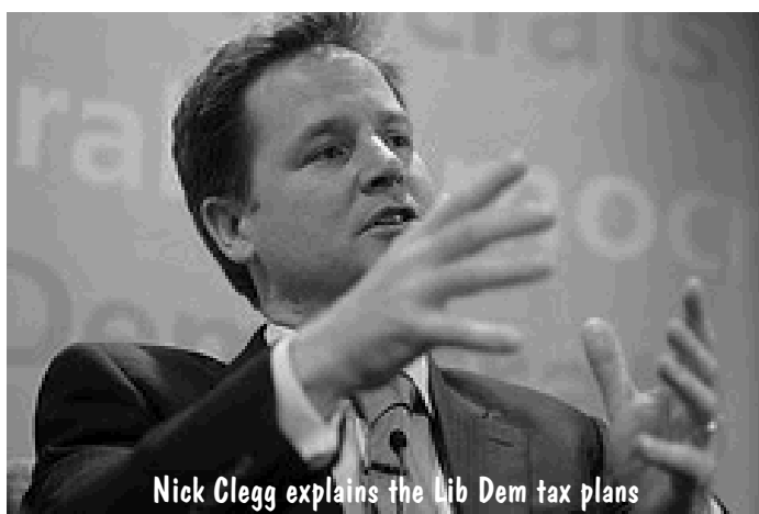
Nick Clegg explains the Lib Dem tax plans

These plans mean that almost 4 million people on low incomes would no longer have to pay any income tax at all."