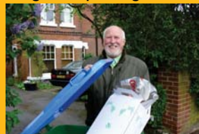
Local Lib Dems favour kerbside recycling.