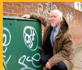
Reporting graffiti - these were in Lawn Road.