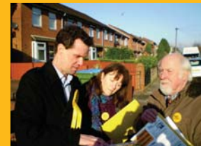
Carrying out a survey in Adelaide Road. Lib Dems keep in touch with what YOU think about your area.