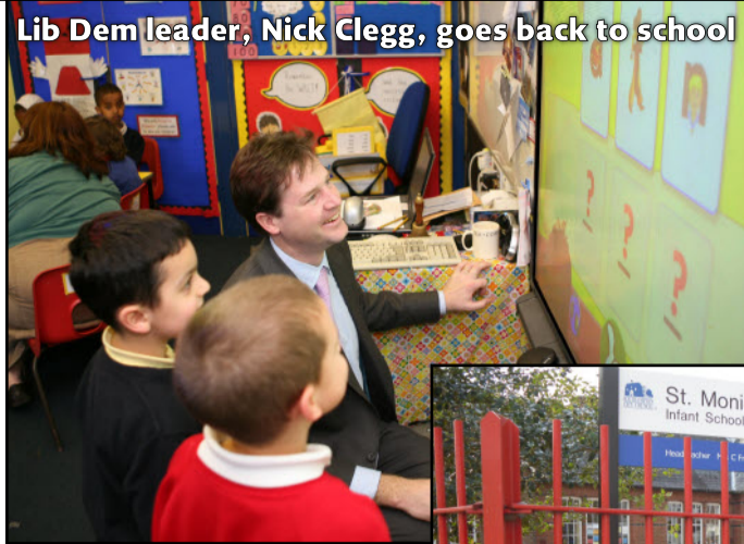
Lib Dem leader, Nick Clegg, goes back to school