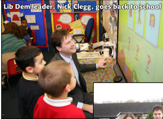
Lib Dem leader, Nick Clegg, goes back to school