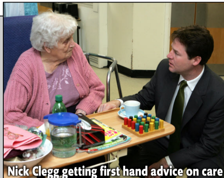
Nick Clegg getting first hand advice on care